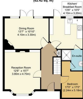
Ground Floor Approximate Floor Area 723 sq. ft (67.18 sq. m)

The Close, RH6 Approx. Gross Internal Floor Area 1,395 sq. ft / 129.60 sq. m